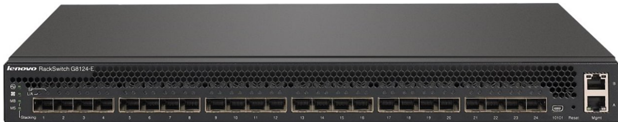
Figure 1. Lenovo RackSwitch G8124E

With support for 1 Gb Ethernet or 10 Gb Ethernet, the G8124E switch is designed for those clients that use 10 GbE today or plan to in the future. This switch is the first top of rack (TOR) 10 GbE switch that supports Lenovo Virtual Fabric, which helps clients significantly reduce cost and complexity when it comes to the I/O requirements of most virtualization deployments. Virtual Fabric can help clients reduce the number of multiple I/O adapters down to a single dual-port 10 GbE adapter and reduce the required number of cables and upstream switch ports.