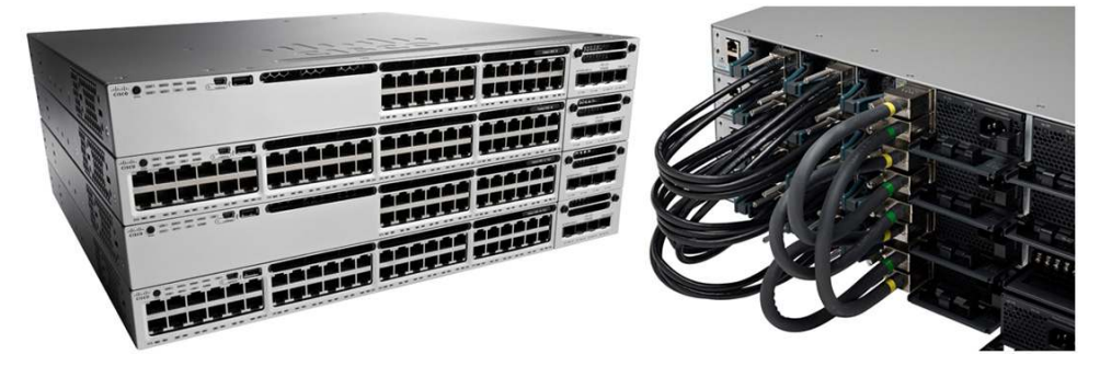
Table 1 shows the Cisco Catalyst 3850 Series configurations.

Figure 3. Cisco Catalyst 3850 Series Switches