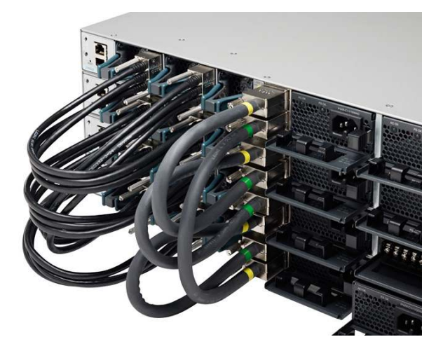
Figure 2. StackWise-480 and StackPower Connectors

StackPower can be deployed in either power-sharing mode or redundancy mode. In power-sharing mode, the power of all the power supplies in the stack is aggregated and distributed among the switches in the stack. In redundant mode, when the total power budget of the stack is calculated, the wattage of the largest power supply is not included. That power is held in reserve and used to maintain power to switches and attached devices when one power supply fails, enabling the network to operate without interruption. Following the failure of one power supply, the StackPower mode becomes power sharing.